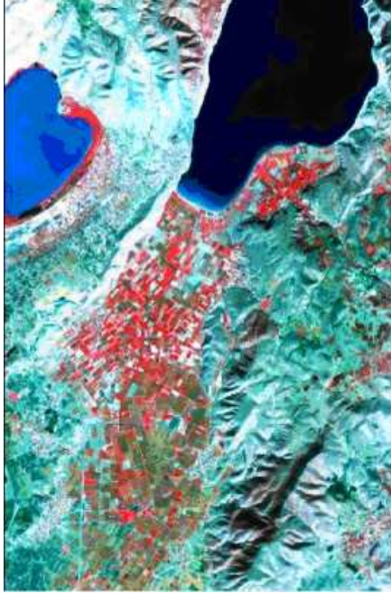
Figure 1: RGB composite of the ASTER image of the study area (Lake basin of Vegoritis). On Red, the NIR band (band 3N) of ASTER is displayed, on Green, the Red band of ASTER (band 2) is displayed and on Blue the green band (band 1) of ASTER is displayed.