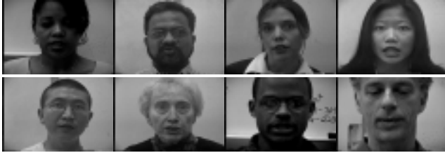
Fig. 2. IBM ViaVoice™ audio-visual database example subjects.

the audio channel (see Section 7). One would therefore expect that a lower-dimensional representation of (4) could lead to equal, or even better, HMM performance, given the lack of accurate probabilistic modeling in very high dimensional spaces. Similarly to Section 3, we consider LDA, followed by MLLT, as a means of obtaining such a dimensionality reduction. The final audio-visual feature vector is then (see also (3) and (4))