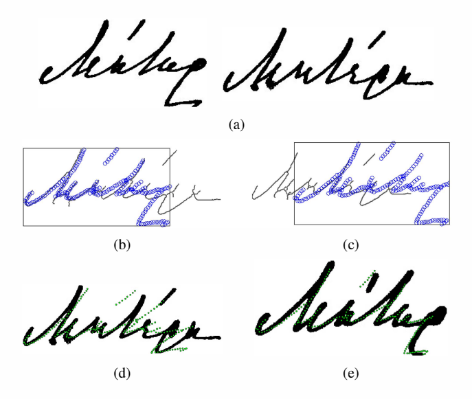
Figure 2. Query detection. (a) Query image on the left, test image on the right. (b)-(c) Initializations of TPS-RPM by centering the query to the word's center. (d) The output shape (false positive) is superimposed in green on the test image. (e) Superimposed output shape in green upon an actual instance (the figure is better seen in color).

of each PAS feature, as well as its segment lengths are normalized by dividing with its scale s. As segment lengths are often inaccurate, higher weight is given to the two other terms of the dissimilarity measure.